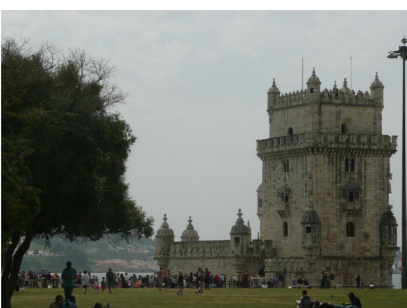
Figure 4. Crowds of tourists in Paris and Lisbon