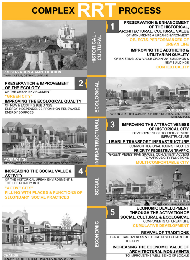
Figure 2. Components of the complex RRT process

For the historical-cultural component, these are the following tasks: