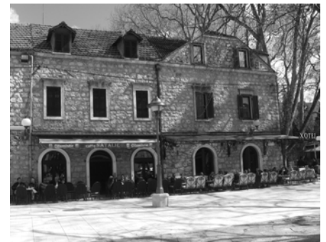
Figure 2. City square

Even though the listed elements are mentioned separately for the purpose of analysis of Trebinje's assets for branding, they should be considered integrally when building a recognisable city image of Trebinje.