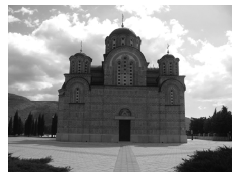
Figure 4. Herzegovina Gračanica Church and park

St. Vasily of Ostrog was an important figure in the history of Trebinje. He was born in the village of Mrkonjić in the carstic plain of Popovo near Trebinje. His family house has been reconstructed, along with his mother's grave, and is a pilgrimage destination for Orthodox Christians. His name is also linked to Tvrdoš Monastery, where he lived for a while. The ties between St. Vasily and Trebinje are very important for the growth of religious and cultural tourism.