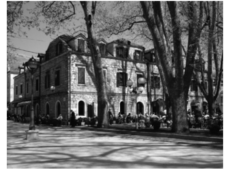
Figure 1. Plane-tree park

meets all the three criteria. The text below lists and expounds the most prominent assets of Trebinje.