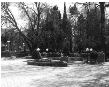
Figure 3. Monument to Jovan Dučić at the entrance to the city park

The Herzegovina Gračanica Monastery has an open-air amphitheatre used by Trebinje's citizens as a gathering place. The flat top of Crkvina Hill is one of the city's prominent spots, with the most