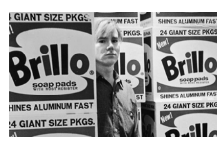
Fig. 5. Andy Warhol in New York, 1964 with "Brillo Boxes", http://www.guardian.co.uk/artanddesign/2010/aug/2 1/warhol-brillo-boxes-scandal-fraud

Arthur C. Danto in ready-made context examines transforming factors which separate a work of art from an everyday object, when visually they cannot be distinguished one from another. He explains transfiguration as relocation of the product from one context to another, whereupon the act of dislocation leads towards the new meaning and sensory appearance of the product. On the example of Marcel Duchamp Fontain from the year 1917, Danto indicates that objects become different works, depending on their interpretation. Introducing the concept of World of Art, he distinguishes between the status and aesthetic value of a single object. That induced George Dickie's Institutional Theory of Art. in which he leaves the decision of whether something is a work of art to the institutions of the artistic world (critics, historians, curators).