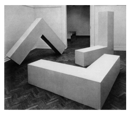
Fig. 4. Moriss R. Untitled- L beams at the exhibition "Primary Structures: Younger American and British Sculpture" (April 27 - June 12, 1966), http://rsataiwan.blogspot.com/2010/04/3-lbeams-robert-morris-1965.html

When we are in a position to perceive two or more similar phenomena, it questions not only our visual distinguishing, but aesthetic experience as well. Conflicting interpretations and evaluations expand their focus from ontological to gnoseological, semiotic and axiological aspects of relativism in aesthetics.