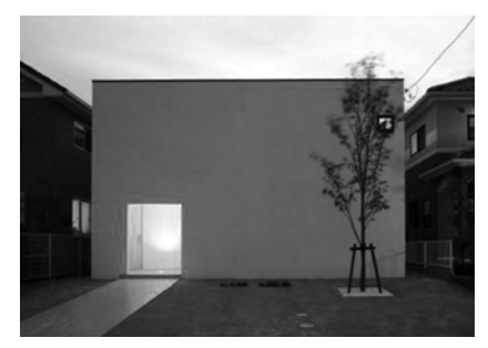
Fig. 10. Rectangular shaped house with one opening, AH architects, Japan 2005 http://www.a-h-architects.com/photo/akb/akb.html

Different qualities of certain forms require for their way of existence and appearance to be studied the relation of manifestations of minimalism in architecture in Serbia and Japan. In Belgrade, there are places and buildings belonging to the minimalism in architecture according to their formal visual aspects. However, these phenomena in our background are not recognised, accepted, and defined as such. For the most part it is friable, neglected and inconspicuous architecture represented by hovel facades, underground passages, and passages within the city blocks. On the other hand, similar sequences can be identified in Japan, where they represent typical examples of aesthetic figuration of formal characteristics of minimalism in architecture. Dualism in manifestation produces a situation in which a certain type of architectural form is ignored in one cultural background, while in another it is highly aesthetically appreciated.