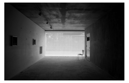
Fig. 1. Private home- gallery, Oita City, 2002., http://www.shio-atl.com/work 06 ss.html

The starting point of this study is a conducted experiment - spatial installation in an underground passage underneath an overpass in Belgrade. The concept of the installation was developed on the basis of the idea of visual and material analogy to the existing apartment in the Japanese city of Oita. Transposition of physical spatial elements of the Japanese apartment is done by altering wall plastics and furniture disposition (pictures and chair designed by Arne Jacobsen) in the underground passage. The experiment produces a compositional identification of the Belgrade and Japanese sequences and for a short time simulates the change in function of the underground passage, virtually placing the apartment in it. Two represented images, two photographic sequences of interior space architecture make possible comparative analysis of perceptive qualities and aesthetic experience, based on similar formal visual aspects.