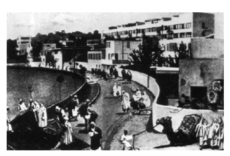
Fig. 7. http://nseuropa.org/English/Art/art0.htm

Regardless of in which line of meaning preconceptions act (practical value, ideological construction, cultural metaphor, or symbolic archetype), one thing they have in common is functioning by means of association through similarity. This paper emphasises similarity as a catalyst for associative course of mind which can create preconceptions.