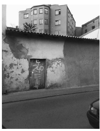
Fig. 11. Rectangular shaped house with one opening, Hercegovačka street, Belgrade

If we comprehend tradition in architecture through the form and not the idea, considered formal visual aspects of minimalism in architecture can become symbols for the things expressing them (underground passages, ruins, hovels). There is an interchange of symbolic and pragmatic meaning. Formal visual aspects remain unexpressed, because of predominance of function, status, physical state and materialisation quality, which significantly influence aesthetic experience. Perhaps these are the reasons for minimalism not being used enough as approach to architectural articulation of living space in Serbia.