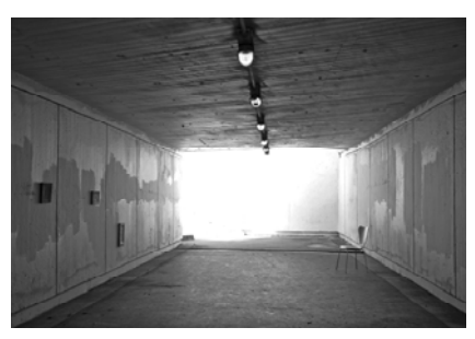
Fig. 2. Underground passage, Belgrade, 2010.,

Using elementary logical operations, the starting findings determine hypothetical postures: