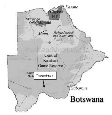
Fig. 2. Geographical setting of Ramotswa in Botswana

Ramotswa urban village is located in the South-East District within the south-east part of Botswana (Fig. 2). The Population and the Housing Census of 2001 indicate that the settlement recorded a total population of 23 232 people (the 2011 Census figures will be provided). Ramotswa lies about 32 km south-east of Gaborone City and it is a headquarter of the South-East District Council administration responsible for primary education, primary health care, tertiary roads, village water and wastewater, solid waste management, social welfare and community development, and remote area development. Due to its close