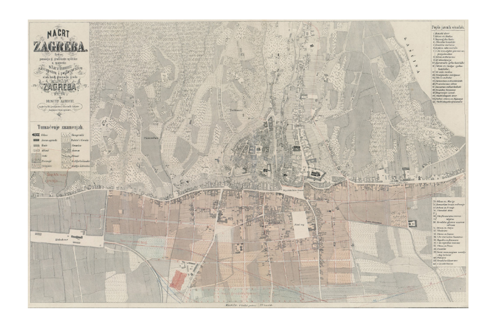
Figure 1. Initiation of the orthogonal city grid in Zagreb

As the modernisation of the city generated the need for the construction of this type of building, the city administration used the legal tools of building codes and urban plans to curb uncontrolled trade in property and the filling of city plots as dictated by entrepreneurs. Plots were built upon arbitrarily until the mid-19th century, when a board was founded to introduce a building permit procedure, which defined the legal framework for the urbanisation of the city (Dobronić, 1983). A new class of wealthy citizens appeared, who invested in projects for this new type of building. The city administration attempted to both encourage and control the purchase, construction, and sale of city plots along the perimeter of city blocks in order to build rental houses. The orthogonal city matrix proved fertile ground for the city's expansion eastward and westward, while building codes determined what could be built on a particular plot (Figure 1). Precise regulations for residential buildings were not drafted in Zagreb until the 1930s, and these prescribed in detail the dimensions of some types of rooms, residential hygiene standards, and the architectural elaboration of buildings. Until this time, the design and construction of rental blocks was significantly less controlled, which meant that their development was partially left up to clients, architects, and master builders (Laslo, 1984-85).