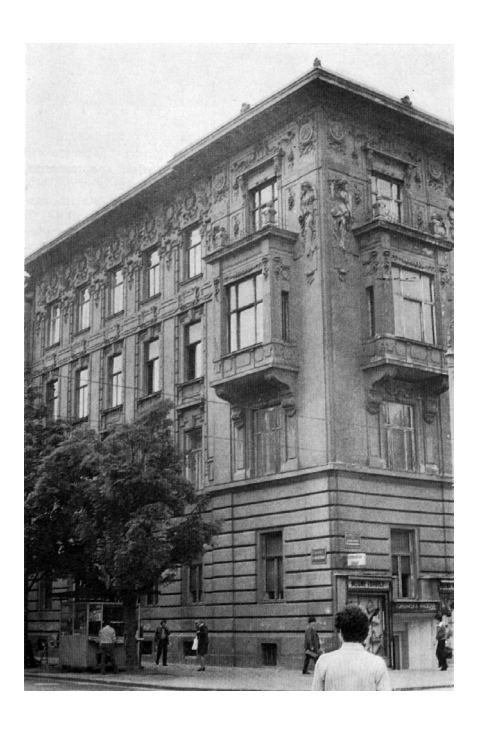
Figure 2. Art Nouveau façades of the Rado rental apartment house

main square, where he lived and opened a dentistry practice (Fatović-Ferenčić, 1998). After six years of work, he invested in a construction plot on the central city thoroughfare and built a rental apartment building exclusively to profit from rent (Bagarić, 2011). With the capital he earned, he soon decided to construct a commercial and residential building at a prestigious, central location - Ban Jelačić Square where he relocated his dental practice and lived with his entire family. Aside from the dental practice and his fiveroom flat, the remaining floors were again intended for rent. There is no need to stress that both of these rental buildings were built in Art Nouveau style. The second one, with its representative elevation, faced the square and featured metal letters that advertised the dental practice, while the selection of a prestigious city location served as an affirmation of Rado's reputation, his numerous clientele, and general success. The square-facing façade was richly ornamented: the first floor had two symmetrical loggias with glass elements within a fine metal sub-structure, and the remainder was filled with organic motifs; the sloped roof was covered in green glazed tiles, and a sign advertising the dental practice featured symbols of the medical profession.