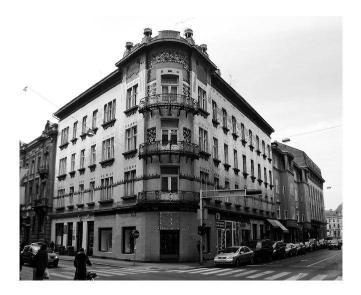
Figure 3. Zagreb's Majolikahaus (Kallina Rental apartment house)