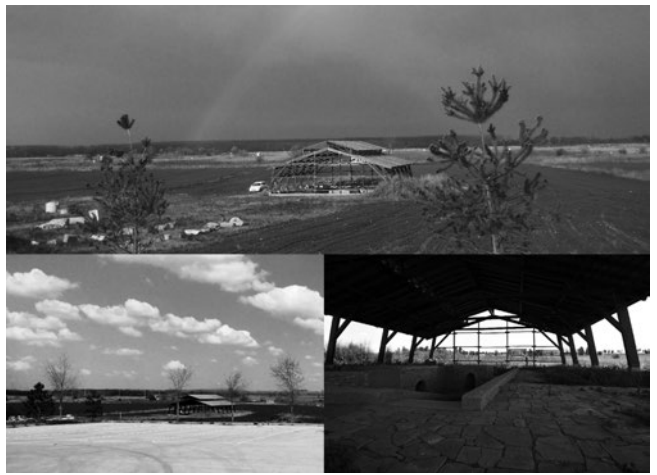
Figure 5. Viminacium memorial buildings (left) and Viminacium craftsmen centre (right)

of the centuries-buried ancient cities began in the 18<sup>th</sup> century, the buildings and decorations have decayed due to atmospheric influences and a large number of visitors. This begs the question of whether the stucco decoration and wall paintings should be moved to the museum, with non-decorated walls left behind, thereby losing the special value of the place and renouncing what lava naturally conserved, or whether it is better to cover the whole space with a protective structure, convert it to a museum, and thus lose its extraordinary urban value (Rizzi, 2007). Both approaches put the authenticity and integrity of the sites into question.