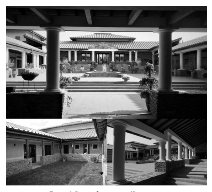
Figure 3. Domus Scientiarum Viminacium

Contemporary processes of scientific research and the sustainable development of archaeological sites require their inclusion in contemporary life. One of the methods for