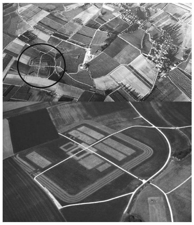
Figure 10. Roman fort in the area of Ruffenhofen, Germany

the area of Ruffenhofen, Germany, a part of the "Frontiers of the Roman Empire" already inscribed on the World Heritage List (UNESCO, 2005), is presented by planting different sorts of low non-destructive vegetation which form and outline the interior areas and buildings of the former fort and accentuate its walls and ditches, enabling visitors to visualise their dimensions, especially looking from a nearby hill (Deutsche Limeskommission, 2010) (Figure 10). Should we present the ancient city of Viminacium by excavations and different ways of protection using protective structures, integrate the excavated ruins into the environment leaving them uncovered, or leave most of the city unexcavated, but marked for future generations? Each of these decisions can be justified by international documents in the area of cultural heritage, and can bring successful results in the area of protection and presentation.