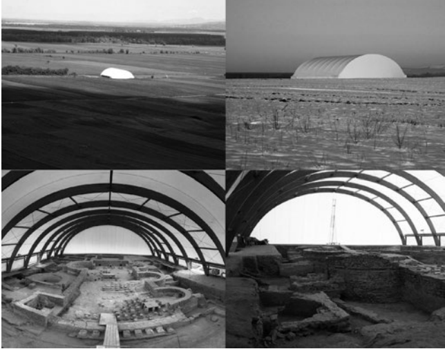
Figure 4. Northern gate of the Viminacium legionary fortress (left) and Viminacium city baths (right)