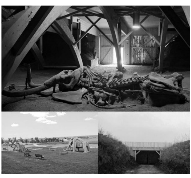
Figure 7. Mammoth Park

glued laminated timber, follows the slope of the surrounding terrain and thus forms an underground exhibition space. The creation of space below the level of the present-day soil is an association with the time context in which the mammoths lived, which is very distant from the present. The entrance to the space is accessed by an earth road that relates to the passage through the natural canyon. The central skeleton, preserved in its entirety, is oriented as it was in the mine. The attempt to partially restore the authenticity of the context in which the animals once lived has been partially achieved using traditional natural materials in the space and layers of sand brought from the spot where they were found. The Mammoth Park has become an attractive ambience, but it has not become an independent museum building. Since it is directly related to the site where the exhibited skeletons were found, it is an integral part of the archaeological park, and it does not dominate over the ancient remains (Nikolić, 2017).