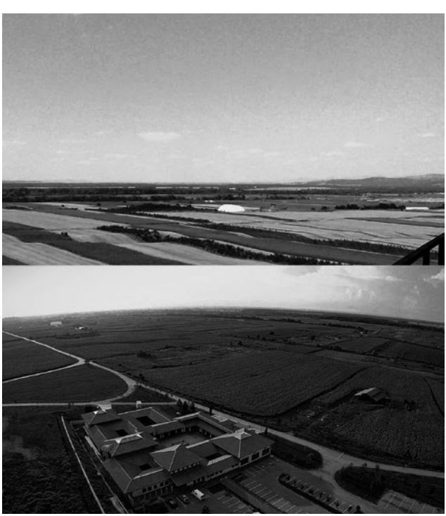
Figure 2. Up: A view from the thermal power plant to a part of the Viminacium Archaeological Park. Down: A view to the Viminacium Archaeological Park with Domus Scientiarum Viminacium in the foreground

excavations<sup>2</sup>, when the city wall and certain city buildings were investigated (Zotović, 1973; Kondić and Zotović, 1974). In the period from 1977 to 1991, large-scale protective research was carried out on the territory designated for the construction of Kostolac B thermal power plant, when necropolises with more than 10,000 graves were excavated, including brick and pottery kilns (Zotović, 1986; Zotović and Jordović, 1990; Korać and Golubović, 2009; Korać and Mikić, 2014).<sup>3</sup> After a break during the 1990s, when illegal excavations at the site reached their peak (Blagojević et al., 2002), the research was continued in 1997. In 2001, Miomir Korać became leader of the Institute project. Since then, research by the Institute of Archaeology and the Center for New Technologies Viminacium has taken place without interruption, in the form of modern scientific research (geophysical research, remote detection, photogrammetry), systematic excavations of the city and legionary fortress, and protective excavations in the peripheral areas that are endangered by the expansion of the strip coal mine and the thermal power plant complex. This continuous research has stopped the looting and made it possible to present the ancient buildings and construct modern facilities, thus forming the archaeological park for tourists. In addition to