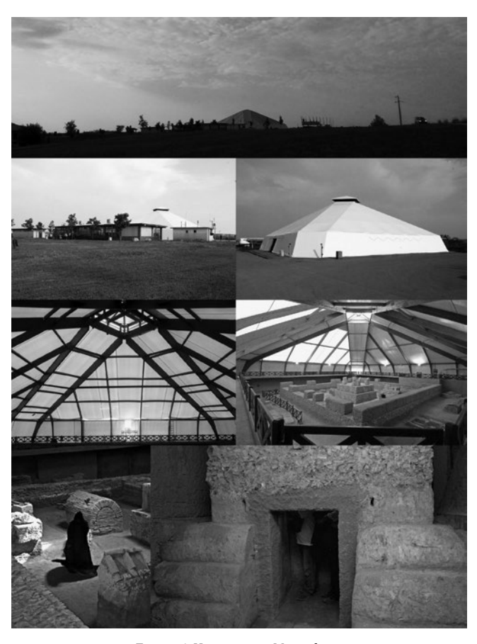
Figure 6. Viminacium Mausoleum

The only site at Viminacium Archaeological Park in which integrated protection and presentation was carried out using interpretation is the Mausoleum (Figure 6). This is an in situ presented part of the eastern Viminacium necropolis, with a restored and partially reconstructed central grave that belonged to a high-ranking individual in the Roman hierarchy (Golubović and Korać, 2013). It is the starting point for visitors and the first site that is presented to them in the archaeological park. The protective structure over the remains of the central grave and part of the necropolis was constructed in the period from 2004 to 2005. The structure, covered with a PVC membrane, is made of glued laminated timber in the shape of a truncated square based pyramid.