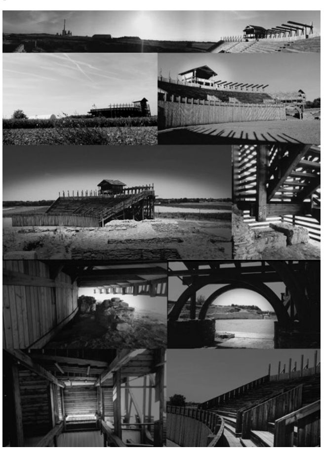
Figure 8. Viminacium amphitheatre

appears as a technical measure which ensures the safety and durability of a building, assuming that we take care not to compromise the monumental properties of the building. However, the solution to the second problem form is much more complex, because then the constructive assembly represents a feature of the building as a monument (Đorđević, 1978). Both cases have occurred with the Viminacium amphitheatre, where it was necessary to strengthen the basic stone walls using contemporary materials, but also where the main characteristic of its ancient structure – the wooden construction – was interpreted as an important part of the reconstruction.