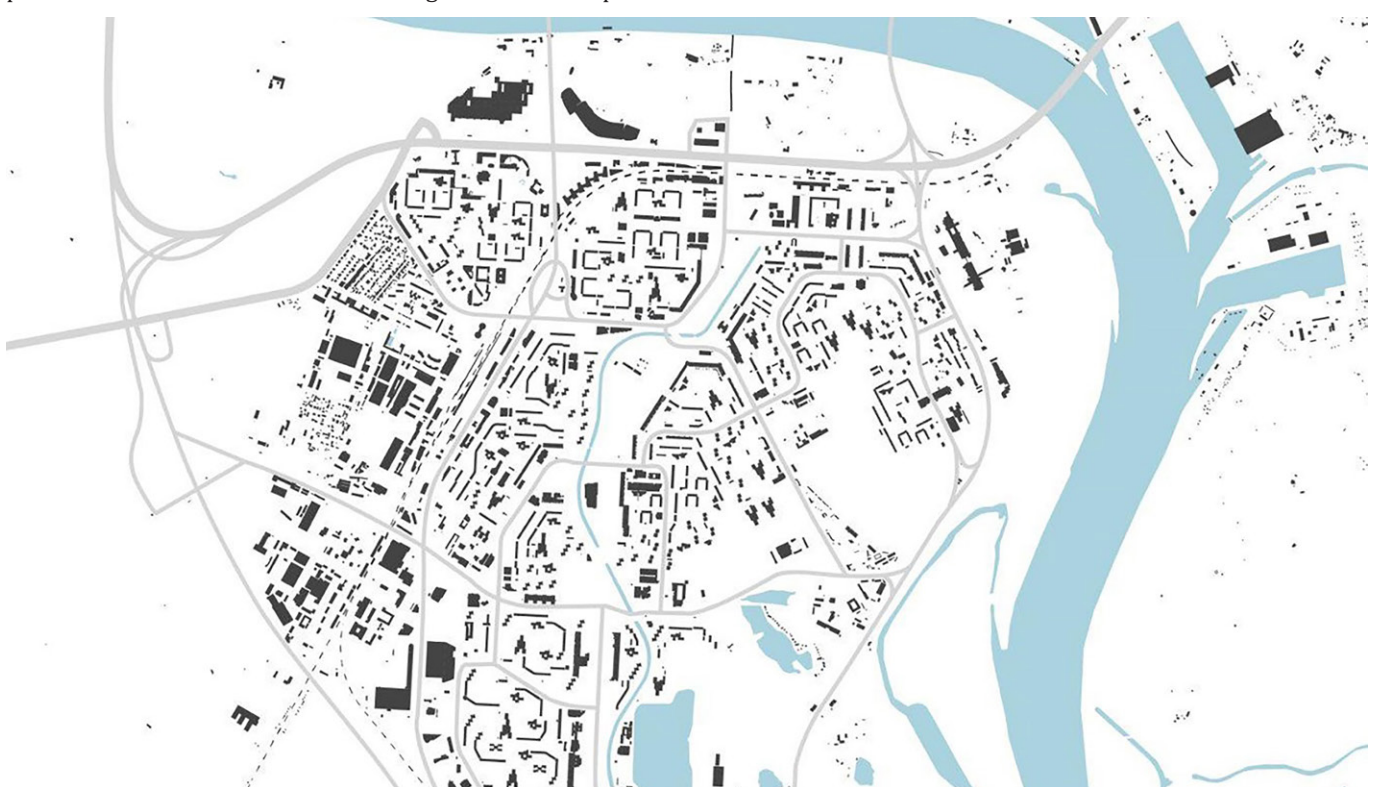
Figure 4. Schwarzplan of Petržalka showing the different urban structures of the mass housing

Some previous elements (roads, "Chorvátske rameno" channel) are almost completely preserved, or the current roads copy the originals, partially preserving the identity of Petržalka.