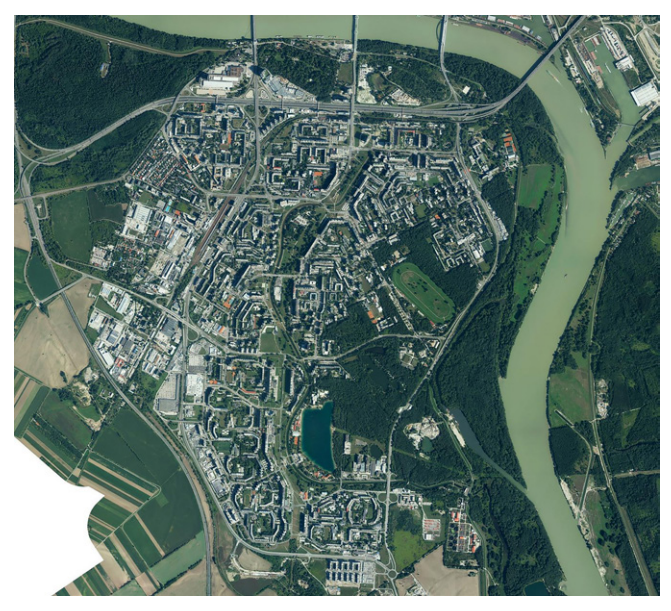
Figure 2. Mass housing structure of Petržalka

big projects of e.g. Brasilia or Novi Beograd, its spirit was not based upon a "great utopian vision", but rather it reflected the technocratic and "worn-down" zeitgeist of the 1970s in former Czechoslovakia, which was at that time one of the greyest socialist countries (Figure 1 and Figure 2). The result is that there has been no disappointment or hangover of failed dreams, and the urban fabric and morphology of Petržalka have proved to be surprisingly suitable for meeting the current challenges of the highly fluent, ambivalent and unstable society (see e.g., Jaššo et al. , 2022a).