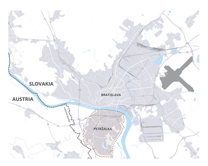
Figure 1. Location of Petržalka in the context of Bratislava

Mass housing estates from the 1960s and 1970s might be considered to be one of the most visible and tangible impacts of 20<sup>th</sup> century modernity (Murzyn-Kupisz and Gwosdz, 2011). On the one hand, they offered a certain standard of housing and dwelling (Ira, 2015), but on the other hand, they brought mass scale, uniformity, standardisation and