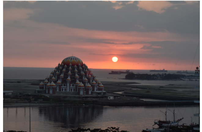
Figure 1. The 99 Domes Mosque and Losari Beach as an example of Identity of Urban in Makassar City, Indonesia

resulting "imageability" also determines its identity. It is concluded that Lynch's emphasis on individuality lies in the uniqueness of a location, such as the 99 Domes Mosque and Losari Beach at Makassar City, Indonesia (Figure 1).