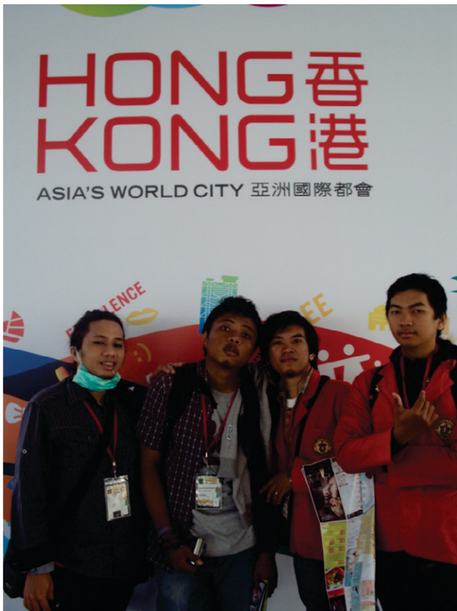
Figure 2. Visitors in front of a billboard that promotes Hong Kong as Asia's World City

branding positions cities on the lines of companies that offer diverse products. Just as companies deploy marketing and branding strategies to draw consumer interest for their products, cities must do the same for goods and services to be in demand.