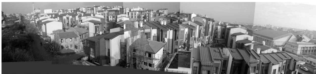
Figure 5. 'New' Sulukule houses from the same perspective in Figure 5, March 2014.