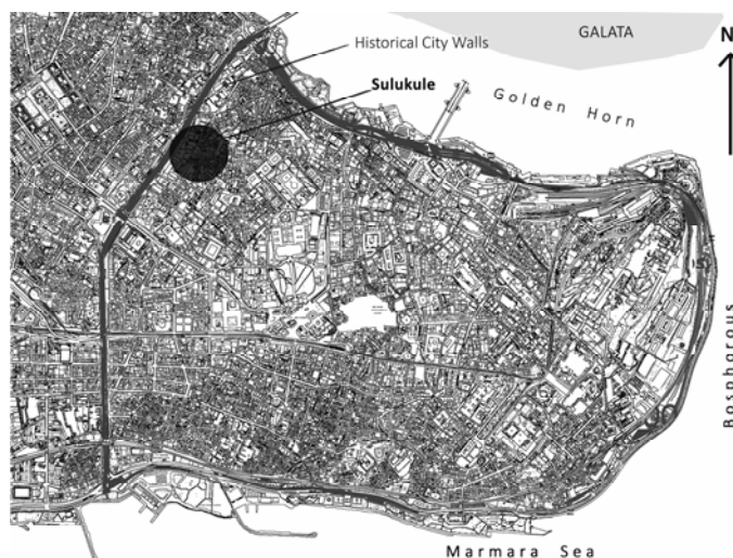
Figure 1. Istanbul city map: Historical city walls and Sulukule. Scheme: İ. Özbek Eren.