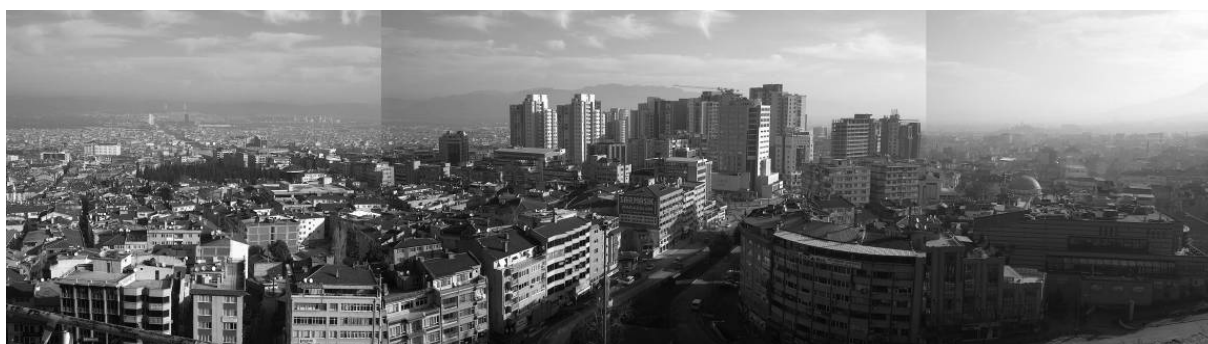
Figure 9. General view from the Historical Clock Tower of The City. Photo by İ. Özbek Eren, Şubat 2012.

Before the project, the neighbourhoods were physically rich in terms of urban morphology and typology. The forms of the houses and the street patterns were in harmony either with the rest of the city, or with the historical commercial buildings close to the area. Although the area itself was not defined as a historical site, its closeness to the site area made it a unique place. Some historical buildings in the area, such as mosques or fountains, were also important landmarks that enriched the region's identity. The old neighbours had known each other for a long time and this publicity had also enriched the identity. The region with its neighbourhood, street-building typology, place-attachment or morphological factors gave distinct identity to the region and also affected its perception.