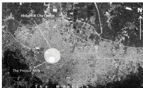
Figure 6. Bursa city general layout; Historical city centre and the project area. Scheme: İ. Özbek Eren

In 2005 The Doğanbey Urban Regeneration project area was launched in the neighbourhoods called Doğanbey, Tayakadın, Kiremitçi and Kırcaali, located nearby the historical city centre. The area was designed as Central Business District in 1993 due to its proximity to the historical city centre. Consequently, commercial activities increased; however, the Doğanbey Neighbourhood turned into a slum area within this commercial district (Özbek Eren and Özeke Tökmeci, 2012). Initial preparations for the project began in 2005. Finally on 28.11.2006, The Prime Ministry Mass Housing Development Administration and The Osmangazi Municipality signed a protocol on 'The Doğanbey Urban Regeneration Project'. The neighbourhoods Kiremitçi, Tayakadın, Doğanbey and Kırcaali (282,000 m 2 area) were declared as 'Urban Regeneration Area' (Urban Regeneration and Bursa Report, 2008) (Figures 7, 8). The apparent reasons for urban regeneration were that the area has no functions, it is economically in decline, and the infrastructure is in miserable condition. They are mostly detached buildings with 1-2 floors and gardens. Therefore it is hard to rehabilitate these buildings in accordance with modern housing conditions. In addition, joint-ownership, legal reasons, social problems, housing rights etc. prevented the implementation of the project. Because most of the locals are low-income dwellers, it was also