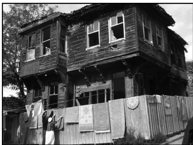
Figure 3. A typical traditional Turkish house.

One of the reasons that locals in Sulukule did not wish to leave the neighbourhood are these gradually strengthened relations with the neighbours and the feeling of attachment. Unit cost of the houses in the area was 3,500-4,500 TL/ m 2 (The Guardian, 2011), however owners were only paid 500 TL/ m 2 and evacuated houses were sold to the new owners who paid 10 times more (Kocabaş and Gibson, 2011). In other words, Romani people had to abandon their houses where they had lived for centuries (Dağlar, 2011). Only 10% of the residents were able to afford payments which will last 15 years. Others, who were unable to pay, were provided mass houses constructed by TOKİ which are located 40 km away from the city centre (Kocabaş and Gibson, 2011). The debates on the project primarily focused on Romani inhabitants' networks of relations and the break of continuity within the area (Dinger, 2009) (Figure 5).