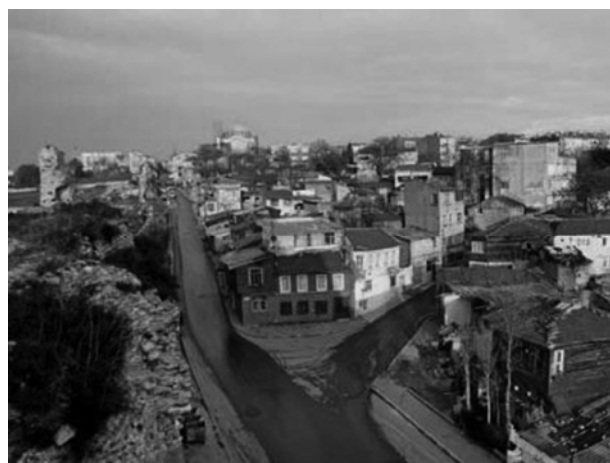
Figure 4. General view before the project. http://www.hkmo.org.tr