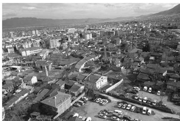
Figure 7. Tayakadın Neighbourhood before the demolition.