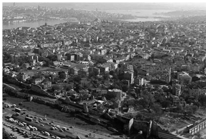
Figure 2. Sulukule general view, 2010.