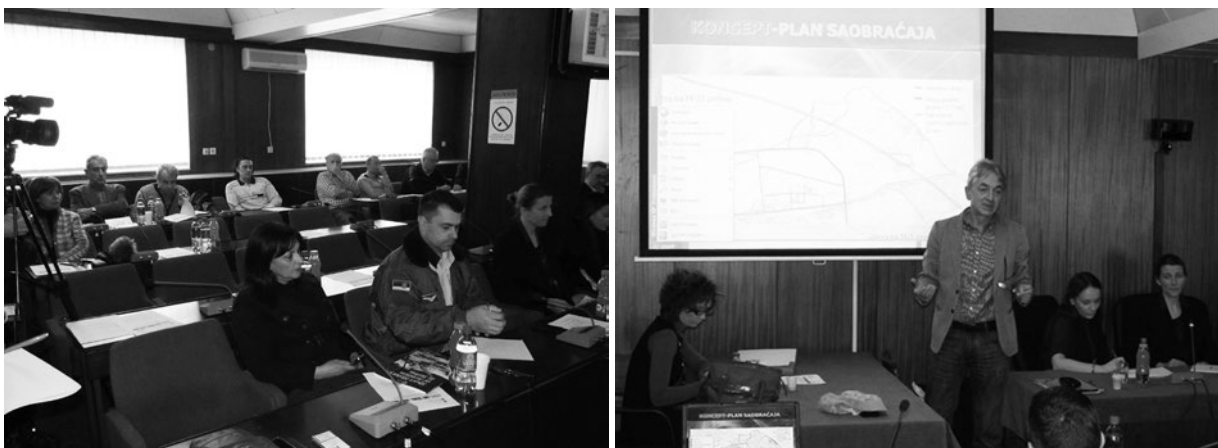
Figure 3. Alternative methods of consultation during formal planning procedures; Discussion between investors and representatives of the public sector in the early stage of drafting the conceptual design solution for the PGR “Industrial Zone – Sport Airfield” in Kraljevo (2012)