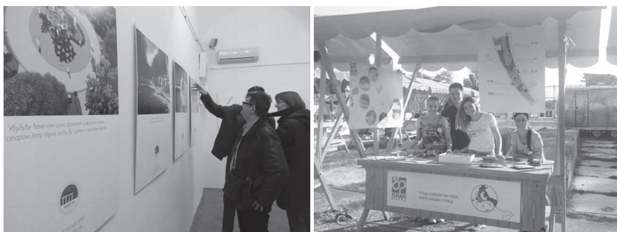
Figure 2. Alternative methods of informing in the early stages of the planning process

Besides traditional formal methods of consultation via public inquiry, and since 2014 early public inquiry, consultation with citizens in sub-municipalities is the most common example of acting beyond the minimal legal obligations in Serbia. Other alternative methods of consultation identified in local planning practice are: