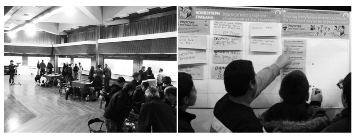
Figure 4. Alternative methods of active participation in the early stages of the planning process; "Speak Out" event in Majdanpek, PDR for development of the tourist area "Rajkovo"

Planning legislation is Serbia is recognisable in relation to the treatment of participation, through established instruments, procedures and mechanisms. Within formal practice, the main purpose of participation is to secure the legal right of participants to be involved in the planning process. Still, there is a general understanding that participation is a legal formality, and has not reached its full capacity within the planning context of Serbia.