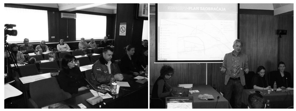
Figure 3. Alternative methods of consultation during formal planning procedures; Discussion between investors and representatives of the public sector in the early stage of drafting the conceptual design solution for the PGR "Industrial Zone – Sport Airfield" in Kraljevo (2012)

<sup>4</sup> Prepared by Čolić, R. (2018) as a monographic study: Encouraging local sustainable and economic development through preparation of Detailed Regulation Plans.